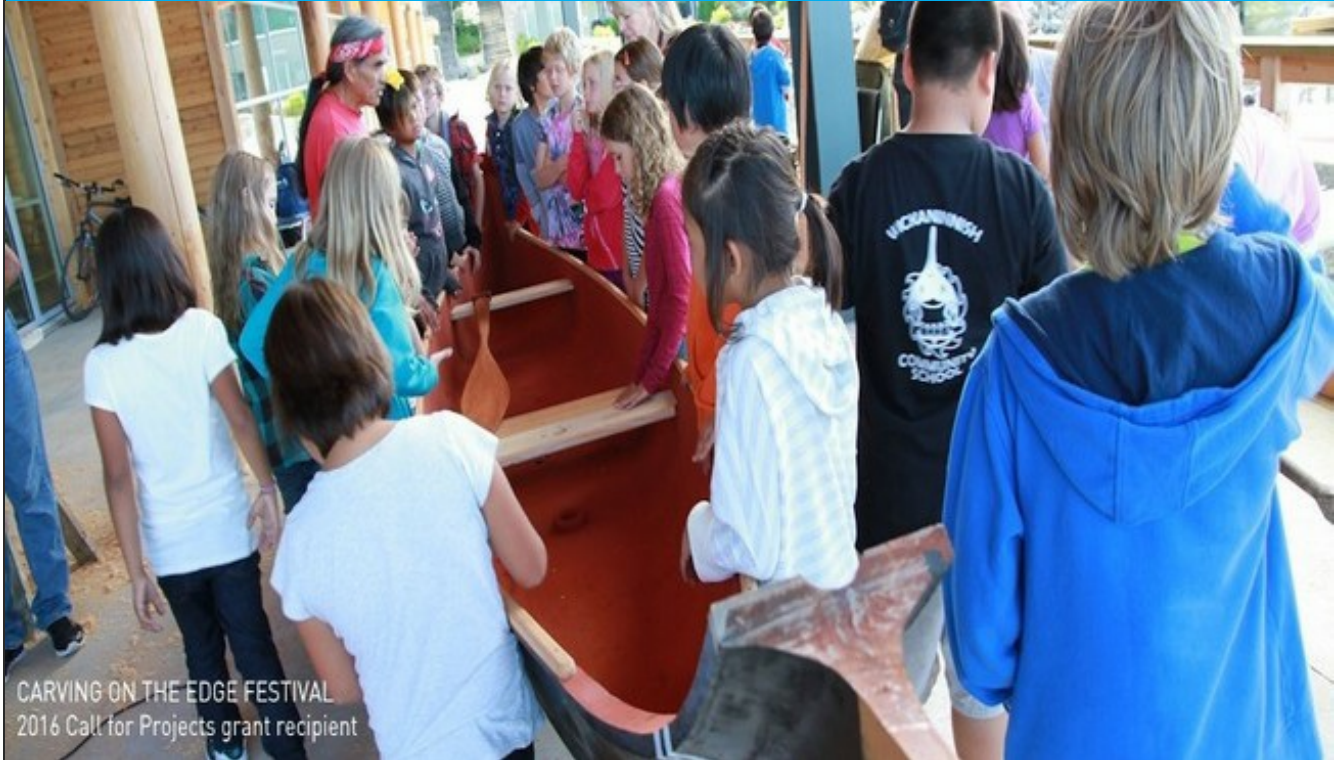
CARVING ON THE EDGE FESTIVAL 2016 Call for Projects grant recipient

With the arrival of a new year, many take the opportunity to pause and reflect. We are doing the same at the CBT. This is a big year for Canada - our 150th anniversary - and from the national to the local level, many plans are already underway to make 2017 a year to remember. If my facebook feed is any indication, the 150th is prompting discussions about what it means to be Canadian. As a Canada Day baby, my national pride started young. At the same time, there are many people in our region who do not identify with being Canadian. My wish is that we take time this year to talk about what it means to be Canadian. The good and the bad. The past and the future. Let's discuss as communities, as a region, and as a country.