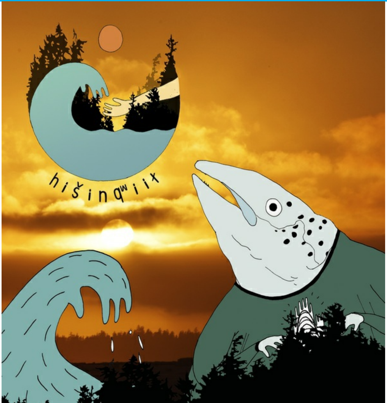
Logo and Poster art by Jaiden George

hišinq w iit̓ , Neighbourhood Small Grants Video, & more!