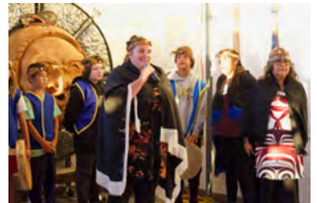
Carving on the Edge Festival 2022 ~ Edge Exhibit Opening at the Shore Pier featuring the Wickaninnish School Dance Group